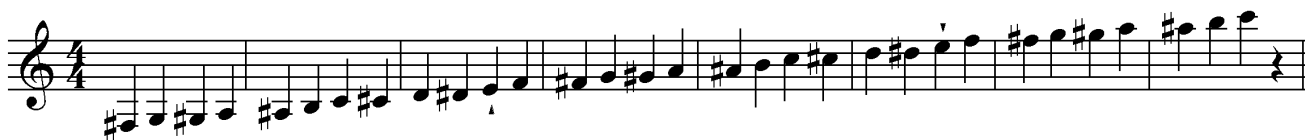
Illustration 2: Bb trumpet range breaks described by Thompson in “The Buzzing Book”. Symptoms for trumpet players may begin at or near these breaks. (Thompson, 2001: 8)